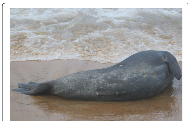
Fig. 2 Presence of 1 = umbilicus and 2 = prepuce, indicating that this individual was a male elephant seal

Female seals tend to return to breeding grounds to moult while mature and sub-adults males typically either return to breeding grounds or migrate to other locations in the Antarctic and sub-Antarctic regions (Setsaas et al. 2007; Slip et al. 1992). The southern elephant seal generally fasts during the moulting period surviving by exploiting the energy in its blubber reserves which have been stocked during the