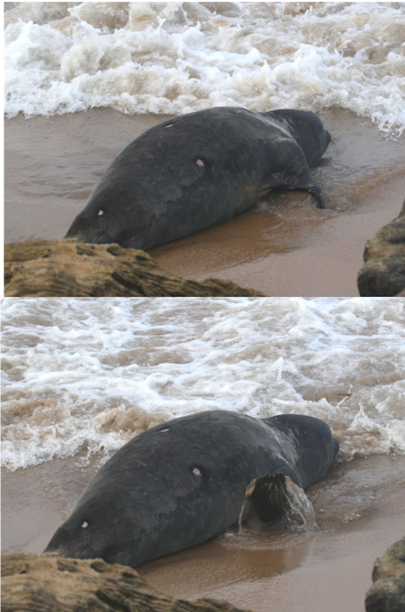
Fig. 4 The southern elephant seal in Sri Lankan waters sand flipping potentially to regulate body temperature