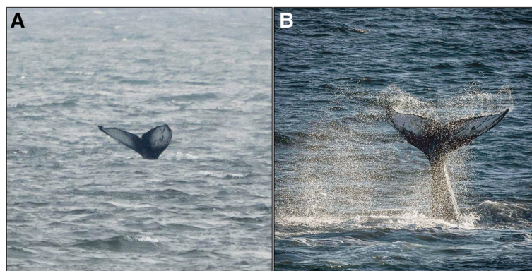
Fig. 1 Humpback whale 'VYking' as sighted in the Firth of Forth, Scotland (a) and Svalbard, Norway (b).

Although photo quality was poor, one individual (nicknamed 'VYking') had a distinct Y-shaped marking on the ventral surface of the fluke and so attempts were made to cross-check the best image with existing humpback whale catalogues from across the North Atlantic region. As no matches were made, FMMP members then conducted Google image searches and made a successful match to an image taken of a non-catalogued individual in Svalbard, Norway (Fig. 1). 'VYking' was photographed in the Firth of Forth ( 56^{\circ}02'19''\text{N} , 3^{\circ}11'36''\text{W} ) on 23rd February 2018 and the Norwegian photograph was taken the previous year on 31st May 2017 at Isfjorden near Longyearbyen in Svalbard (approximately 78^{\circ}15'\text{N} , 15^{\circ}04'\text{E} ) (Fig. 2). This represents a minimum at-sea distance movement of 2610 km.