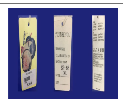
Fig. 33 La Lisa label

Santos-Roldán et al. Fash Text (2020) 7:11 Page 23 of 24