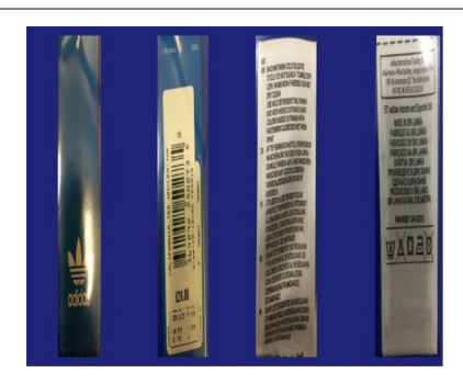
Fig. 34 Adidas label

Received: 3 April 2019 Accepted: 24 December 2019