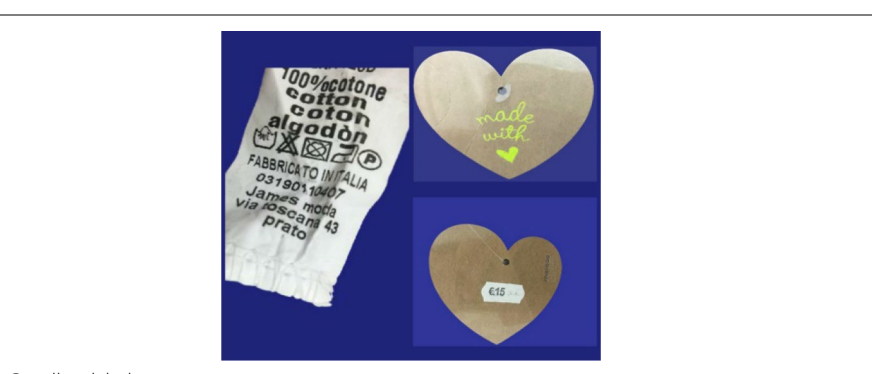
Fig. 3 Capellina label

See Figs. 3, 4, 5, 6, 7, 8, 9, 10, 11, 12, 13, 14, 15, 16, 17, 18, 19, 20, 21, 22, 23, 24, 25, 26, 27, 28, 29, 30, 31, 32, 33, 34.