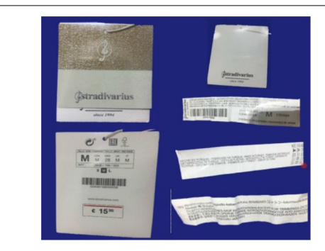
Fig. 11 Stradivarius label

Santos-Roldán et al. Fash Text (2020) 7:11 Page 17 of 24