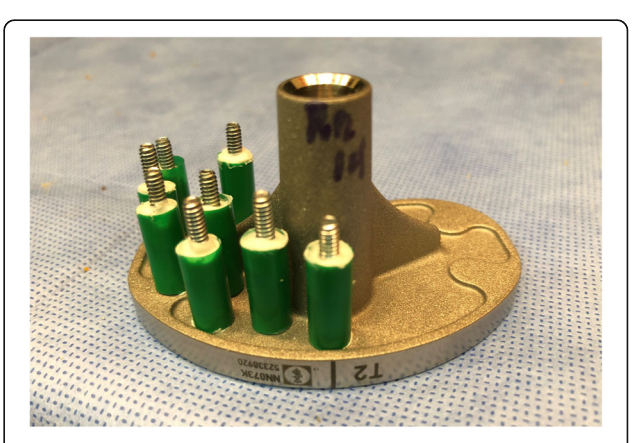
Fig. 2 Tibial tray showing the first phase of dowel application, as many as five cement mixes may be utilized to complete a fully utilized tray area