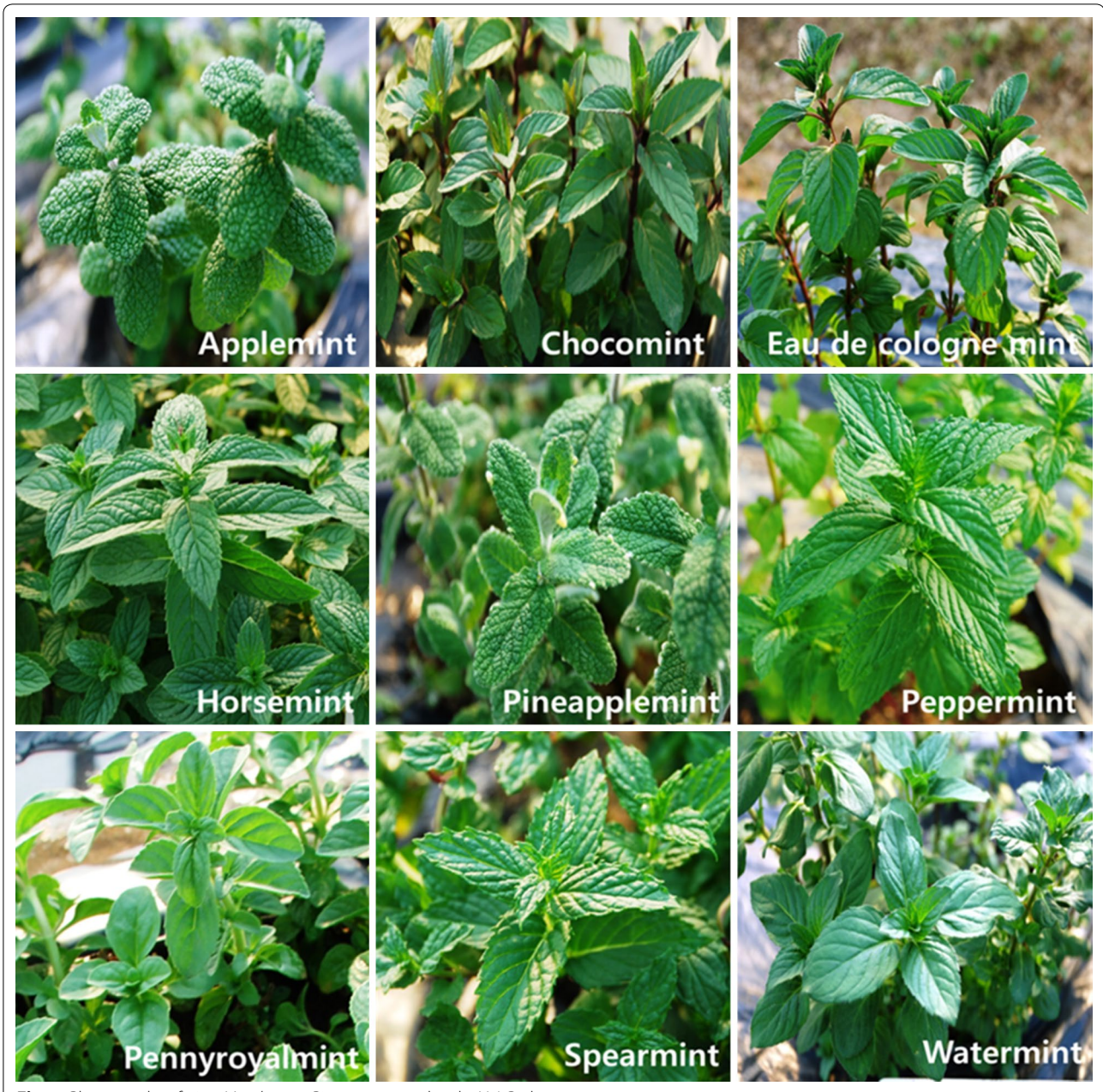
Fig. 1 Photographs of nine Mentha spp

Each Mentha plants (2.0 g) were put into a 15 mL thermostated vial and the SPME fiber was introduced for 12 h into the thermostated vial (RT) with a rubber septum containing 2.0 g of the three fresh aerial parts of each Mentha species during the SPME extraction procedure. A 1 cm long 50/30 \mu m polydimethylsiloxane/ divinylbenzene/carboxen-coated fiber was utilized for analysis. The fiber was adjusted in a GC injection port at for 1 min prior to use. The absorbed component was injected into a GC by desorption at 250 °C for 2 min in