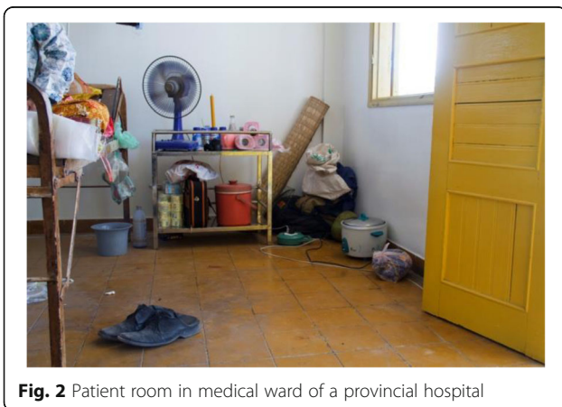
Fig. 2 Patient room in medical ward of a provincial hospital

“We often prescribe for prevention. When we prescribe, we don’t know whether disease is cured by antibiotics or