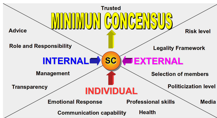
Figure 2 Factors affecting the SC. The SC is an important element in scientific decision-making, but it is affected by many factors.