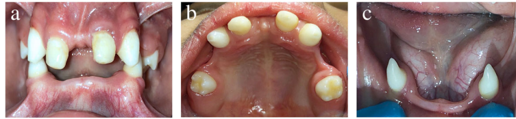
Fig. 1 Preoperative intraoral views showing partial anodontia and thin atrophic alveolar ridges. a Frontal view. b Upper occlusal view. c Lower occlusal view

his parents with a chief complaint of multiple missing teeth. The child had been diagnosed with hypohidrotic ED since infancy by his attending pediatrician, but no other medical conditions were stated. The mother reported that the child experienced heat intolerance because of reduced sweating ability. The boy's family history revealed that he is the third of five children; none of the other siblings have any medical conditions. The boy had a moderate build with a body mass index of 13.8 kg/m 2 .