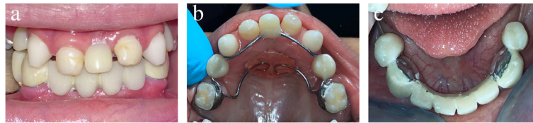
Fig. 4 Postoperative intraoral views. a Frontal view. b Upper occlusal view of the upper Nance appliance with acrylic teeth. c Lower occlusal view of the lower fixed partial denture

dental home [6] and to explain to the parents the treatment stages required as the child grows. Pigno et al. recommended use of a dental prosthesis before the child goes to school at around 3–4 years of age [7], which is in agreement with a systematic review by Schnabl et al. , who found that the median age of prosthetic rehabilitation in patients with ED is 4 years [8]. Early prosthodontic