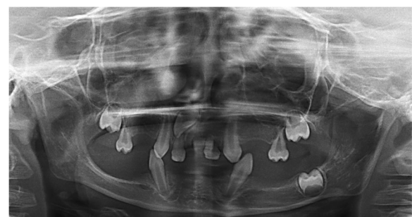
Fig. 2 Panoramic radiograph showing the presence of four unerupted permanent tooth germs

The proposed design for the upper arch was a Nance space maintainer with a saddle to replace upper primary first molars. A single incisor tooth was incorporated into the appliance to fill the big gap between the present anterior teeth to improve the aesthetics and smile. The plan was to use the appliance provisionally until the eruption of the upper right permanent lateral incisor. The lower arch was planned for an 8-unit ceramic bridge with ceramic-metal crowns on the two abutments (lower permanent canines) replacing the missing incisors and primary first molars. The lower appliance extended to the primary first molars without including the second primary molars to reduce the load on the abutment teeth. The pontic design was chosen to be of the modified ridge lap type, which has a concave fitting surface only at the facial surface, with the rest being convex, allowing it to contact the ridge only facially. Such a pontic design prevents food accumulation, making the