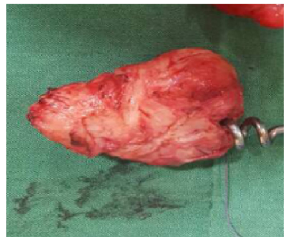
Fig. 4 Parasitic myoma after excision