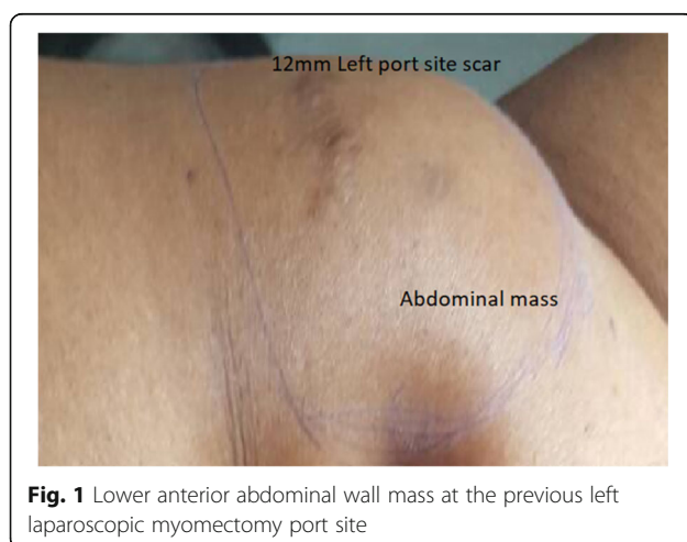
Fig. 1 Lower anterior abdominal wall mass at the previous left laparoscopic myomectomy port site

Given the nonspecific presentation, there is no specific investigation that is ideal in the diagnosis of parasitic myomas. The definitive diagnosis requires confirmation