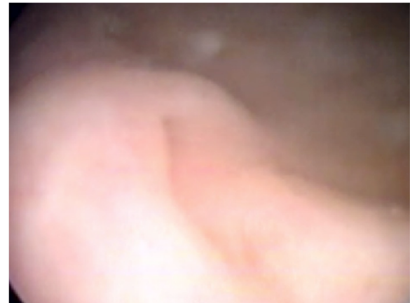
Fig. 3 Appearance of the right ureteral meatus after JJ stent removal

showed only a left vesicoureteral reflux (VUR). Two months later, the patient underwent a right posterolateral lumbotomy on the existing scar. The UPJ was found and the ureter under it was dissected, but it was impossible to pass ureteral probes from his ureter to his bladder. For this reason, a median cystostomy was performed and a Pollack probe was introduced in the ureter by the proximal ureterotomy, to carry out the right ureteral meatoplasty with a 4,7 Ch JJ ureteral stent. The pyeloureteral anastomosis completed the surgical operation. Ten weeks after the second surgery, the baby underwent cystoscopy to remove the JJ stent (Fig. 3). During the same procedure, VUR correction was performed by subureteral injection of dextranomer/hyaluronic acid copolymer as bulking agent. During the follow-up, a healthy renal function and a normal excretory function of both kidneys were confirmed by ultrasound scans (Fig. 4) and mercaptoacetyltriglycine (MAG3) renal sequential scintigraphy which showed a split function of 40% for his right kidney. Thirty months