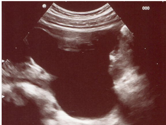
Fig. 1 Longitudinal ultrasound image of right renal pelvis