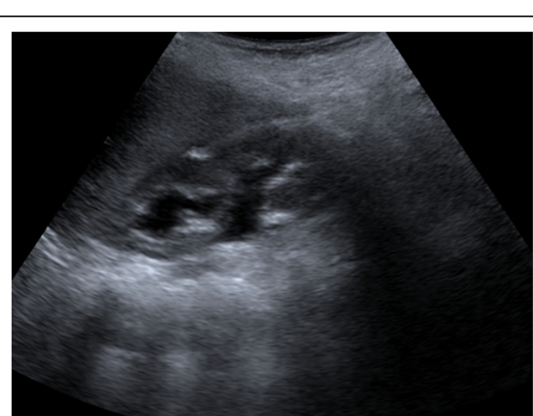
Fig. 4 Ultrasound image 30 months after surgery