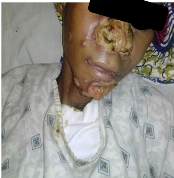
Fig. 1 Nasal and mental area ulcerations

She was treated with amphotericin B given intravenously at 1 mg/kg for 2 weeks with mild improvement