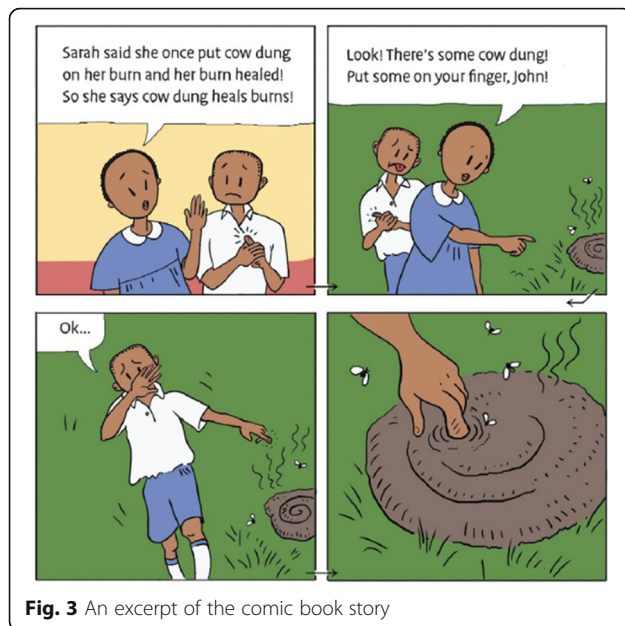
Fig. 3 An excerpt of the comic book story

examinations) between children in the two comparison groups.