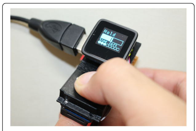
Fig. 1 Photograph of the developed device. The feedback function is shown in an OLED display

Compared with the high failure rate of the CRT measurements without the feedback function, the feedback function, which served as a guide for the pressing strength and time, achieved complete success in fulfilling the required measurement conditions of the CRT measurement using the portable device. The critical issue of the CRT measurement is the intra-observer difference [4]. Personal work experience and training have been suggested to possibly help improve the accuracy of CRT measurements [5]. Evidently, in the present study, the feedback function