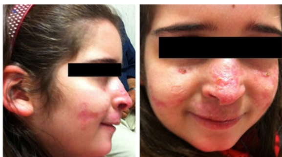
Figure 3 Picture of the patient after five months of systemic treatment with Isotretinoin (0,5 mg/kg/die): the erythematous, papular-nodular and ulceronecrotic lesions disappeared with some residual pitted scars.

Cutaneous involvement is common in Ataxia-Telangiectasia and usually it presents with cutaneous telangiectasia, skin atrophy, café-au-lait spots and premature graying. Cutaneous granulomas have occasionally been reported in patients with A-T [3-11], whereas acne rosacea has not been previously described in patients with A-T.