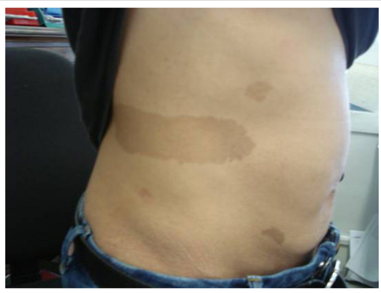
Figure 3 One of the mother's café-au-lait macules.

dominant disease, is instead mainly characterized by "lentigines" (freckles), even if CALMs can also be present. Moreover, this syndrome is characterized by electrocardiography conduction abnormalities, ocular hypertelorism, pulmonary stenosis, abnormal genitalia, retarded growth and sensorineural deafness.