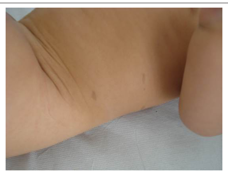
Figure 1 Some of the child café-au-lait macules.

café-au-lait spots) was present in every generation. CALMs are usually the first sign of NF 1 and it is well known that the other clinical manifestations of NF 1 became evident with age [2]. For this reason, we could not exclude NF 1 right away in our patient, but it seemed unlikely because of the lack of the other typical manifestations in the older family members (i.e. Lisch nodules, neurofibromas, gliomas). However, some patients with a NF1 phenotype characterized only by cutaneous signs and specific mutations in NF1 gene (c.2970-2972 delAAT; p.990delM) [3] (c.5425C > T;p.Arg1809Cys) [4], have been