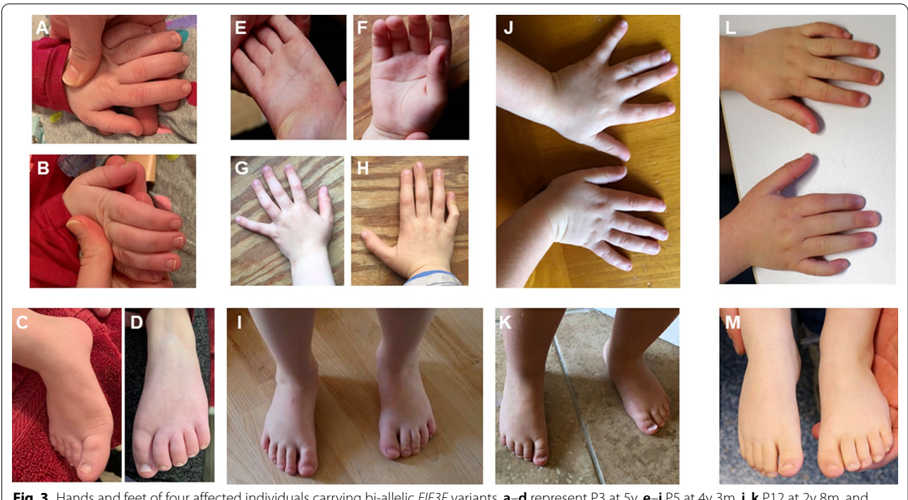
Fig. 3 Hands and feet of four affected individuals carrying bi-allelic EIF3F variants. a–d represent P3 at 5y, e–i P5 at 4y 3m, j , k P12 at 2y 8m, and J , m P13 at 3y 2m. Some affected individuals have puffy backs of hands and feet; most individuals have encased nails (= nails embedded by skin), predominantly of the finger nails and short toe nails. y = years ; m = months

cause of autosomal-recessive NDD. Characteristic features include global developmental delay, delayed speech development, behavioral difficulties, altered muscular tone, hearing loss, ophthalmological symptoms, short stature, and minor anomalies of the ears, nose, hands and feet.