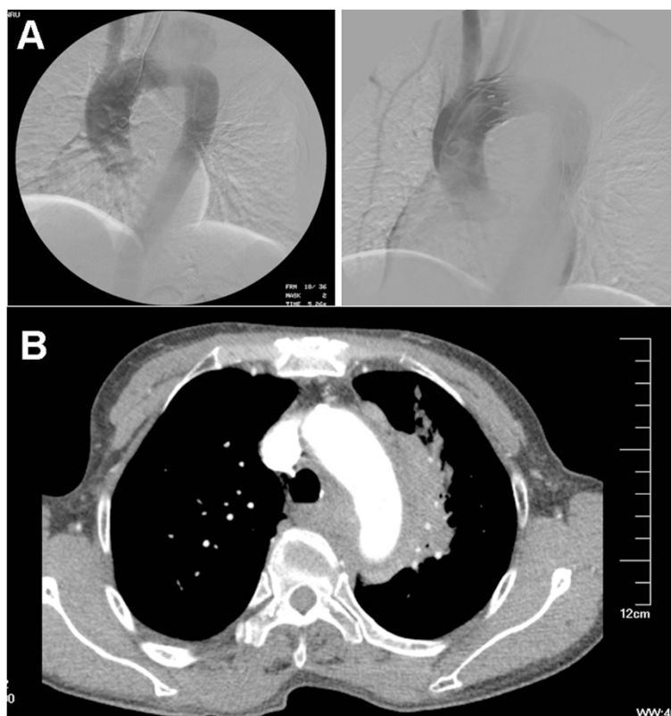
Fig. 3 The determination of treatment effect by comparing. a. DSA angiography before intravascular graft exclusion for thoracic aortic pseudoaneurysm (Left) and angiography after operation (Right); b. Reexamination by Chest CT 6 days after operation

foreign body was seen in hypopharynx and esophagus. The patient was improved greatly and discharged from hospital on 19th, August. Since the first follow-up, the patient felt no pain in the chest, but discomfort in chest after large amount of exercises, and felt better and no obvious discomfort after rest.