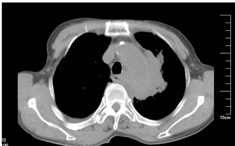
Fig. 1 Radiological examination. One oval-like soft tissue density mass on aortic arch in upper right mediastinum

goiter were in two sides. The patient have experienced cardinal red hemoptysis (about 50 ml), and the symptom was alleviated after expectant treatment of hemostasis.