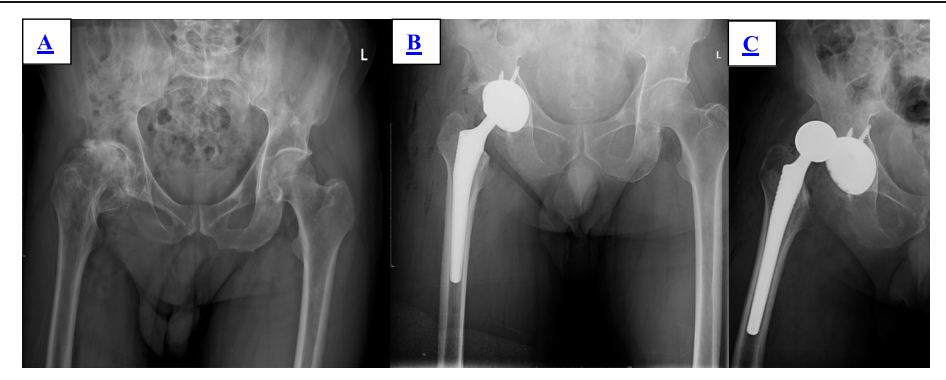
Fig. 2 Male, 38 years old. a Preoperative X-ray showed right Crowe I DDH. b Postoperative X-ray. c Anterior dislocation in the 1st day postoperatively

Some surgeons questioned whether the subtle improvement of LLD and offset would perfect the clinical outcomes [17, 25]. Our study compared the surgical