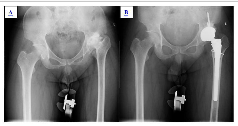
Fig. 1 Male, 52 years old. Due to poor stability of LCU trial, the surgeon changed to S-ROM intraoperatively. a Preoperative X-ray showed left Crowe II DDH. b Postoperative X-ray

influenced, regardless of acceptable offset or acceptable LLD. So we should pay more attention to the balance of leg length and offset in primary THA. In this study, concurrent acceptable LLD and offset were achieved in 87% of patients with the modular stem and in 68% of patients with the non-modular tapered stem. The modularity of SROM provides the surgeon with more choices to reconstruct the dysplastic hip perfectly.