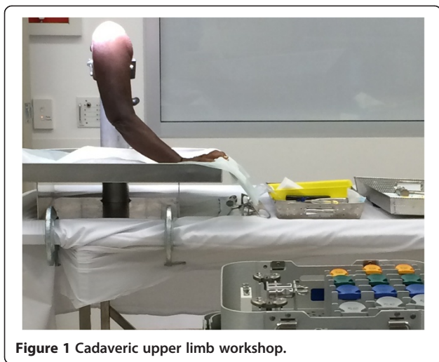
Figure 1 Cadaveric upper limb workshop.

fixation in isolation, without consideration of soft tissue anatomy, and therefore lacks realism.