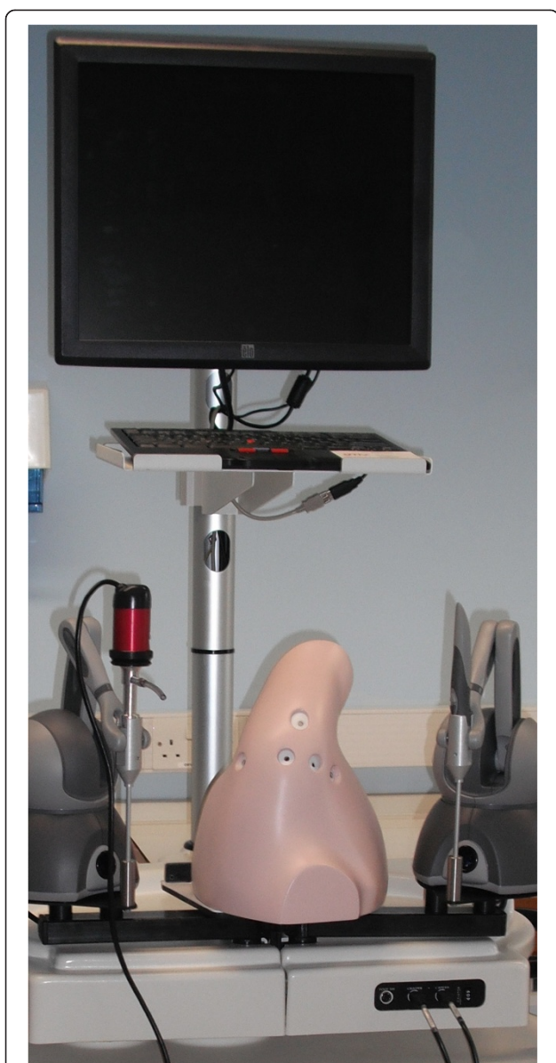
Figure 4 Virtual Reality arthroscopic simulator with haptic feedback. (Insight Arthro VR, Simbionics USA).

Shiralkar states that there is little difference between real and imagined experiences provided that the experience is imagined in a specific manner [51]. Evidence suggests that similar neural pathways are stimulated from imagined muscle movements as physical ones and therefore may be as effective as physical practice [52]. The application of this technique in surgical training is obvious. If proven to be effective, it would provide a low-cost, easily accessible tool that can be applied to multiple different procedures without the need for specialist equipment. The Association of Surgeons in Training (ASiT) in the United Kingdom has recognised the