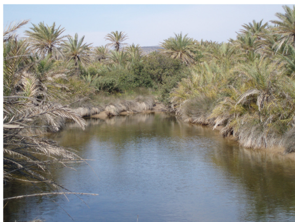
Fig. 4 The palm grove at Vai, Crete (Greece), which according to legend sprouted from dates left here by Arab mercenaries. The folk tradition is slightly marred by the fact that these palms do not belong to the date palm Phoenix dactylifera, but a separate species ( Phoenix theophrasti) with inedible fruits.