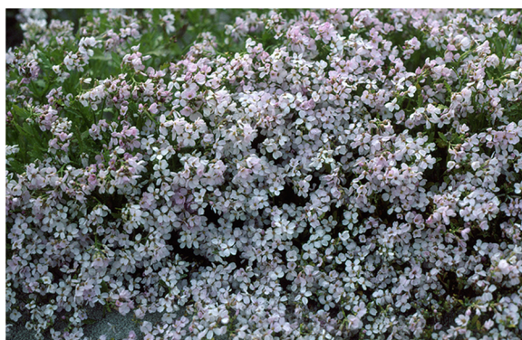
Fig. 2 At Senja in Troms, northern Norway, people believe that a “strange” plant found in the Sandsvika bay derive from a wrecked Spanish ship. In all probability, the tradition refers to Cakile maritima , which occurs abundantly here – and is in fact widespread along the coast.

In addition to the examples cited above, Norwegian plant lore includes a couple of less elaborate examples of plants that, according to folk tradition, have been introduced by strangers or foreigners. Scopolia carniolica is an introduced species in Norway, cultivated as an ornamental and sometimes escaping from cultivation, as noted at scattered stations in southern Norway [32]. At least one such occurrence has received attention in local folklore. According to people at Oppdal in Sør-Trøndelag, the species, locally called isblomst (“ice flower”) and giftblomst (“poison flower”) had been brought there by a Russian soldier [42]. No further details are given, e.g. as to when it happened, or indeed why. Russian soldiers are not frequent visitors in any part of Norway, except as German prisoners of war during World War II. Such a mode of introduction is of course possible, but it is more