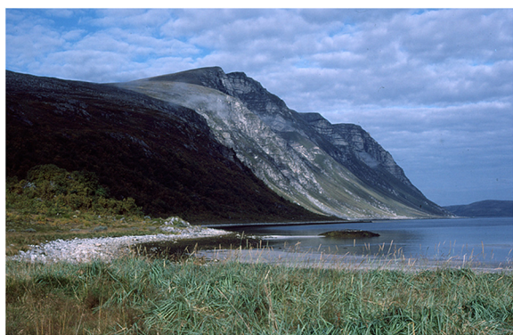
Fig. 1 According to local lore at Vannøya in Karlsøy, Troms, northern Norway, the large stands of Leymus arenarius at the sand dunes at Skipsfjorden represent a kind of grain which sprouted from the cargo of a wrecked Dutch ship – ignoring the fact that the species is indigenous and widely distributed along the Norwegian coast. September 6, 2001

Intrigued by this, I interviewed an old woman who had grown up in Sandsvika. She confirmed the legend, which she had heard from her father and grandfather. When asked about the plants, she described them as growing just