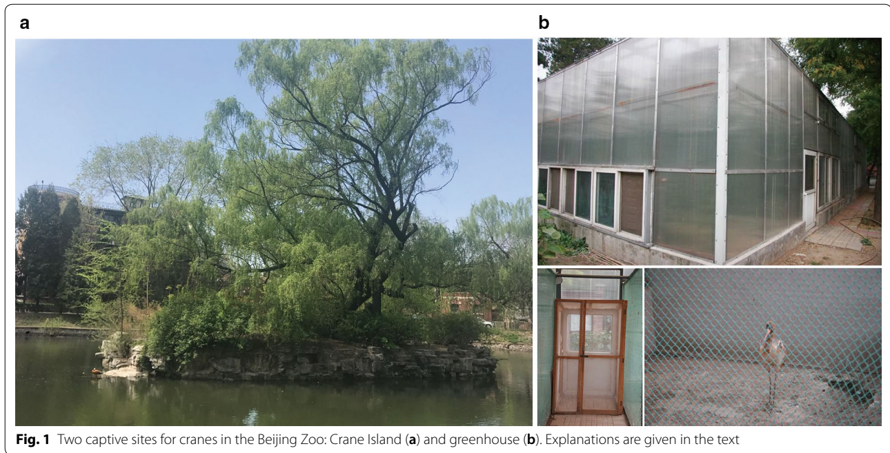
Fig. 1 Two captive sites for cranes in the Beijing Zoo: Crane Island (a) and greenhouse (b). Explanations are given in the text

and stained with Giemsa [1]. Blood samples were also collected for molecular analysis (see below); they were stored in EDTA and maintained at -80^{\circ}\text{C} approximately.