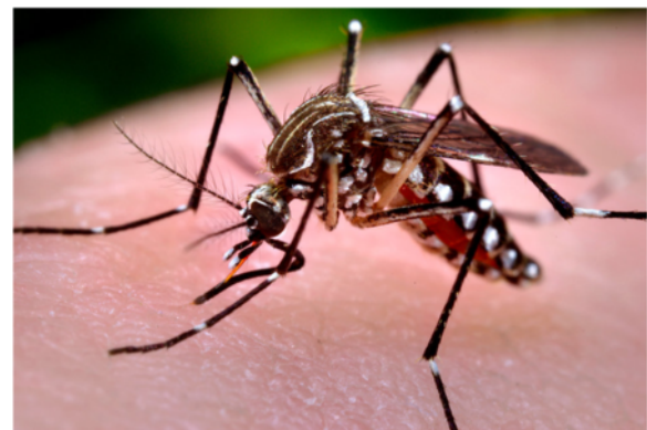
Fig. 1. A female Aedes aegypti mosquito taking a blood meal from her human host. Aedes aegypti mosquitoes infected with Wolbachia are being released in Brazil, Colombia, Indonesia, Vietnam and Australia to prevent the transmission of dengue and Zika viruses.

The first description of a phenotypic effect of Wolbachia on its hosts came in 1971, when Yen and Barr [8] linked the bacterium to a phenomenon known as cytoplasmic incompatibility (CI). Wolbachia is transmitted from infected females to their offspring through eggs and CI allows it to rapidly spread through populations. The bacterium modifies the sperm of infected males during spermatogenesis so that the paternal chromosomes condense when an egg is fertilised, which typically kills the developing embryo [9]. However, if the egg is infected with the same strain of Wolbachia as was found in the male insect, this chromosomal mark is 'rescued' and development proceeds normally. At the population level, the selective killing of Wolbachia -free zygotes causes the frequency of infected individuals to increase. Despite detailed descriptions of how CI disrupts the cell cycle and paternal chromosomes [9], the molecular basis for how paternal chromosomes are marked and then rescued remains unknown. Advances in epigenetics and chromosome biology make this a timely moment to return to this question.