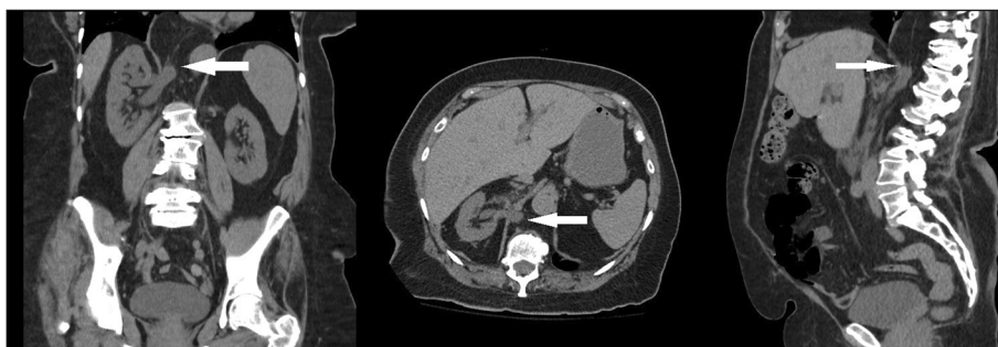
Fig. 1 Patient's initial computed tomography (CT) at presentation demonstrating small loop of ureter within right-sided diaphragmatic hernia. Coronal, Axial, Sagittal views with white arrow showing segment of herniated ureter

The patient had an uncomplicated post-operative course and was discharged home after regaining bowel function and returning to her baseline physical activity on post-operative day three. There were no complications during surgery or recovery. Two months later, we removed her ureteral stent and obtained follow-up imaging which demonstrated repair of the diaphragmatic defect without hernia recurrence (Fig. 3). We also repeated the Tc-99m MAG-3 nuclear medicine renal scan, which now demonstrated normal clearance of the previously obstructed right kidney. Post operative creatinine