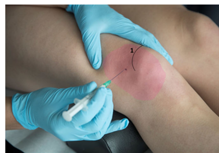
B. 1: upper border of the patella