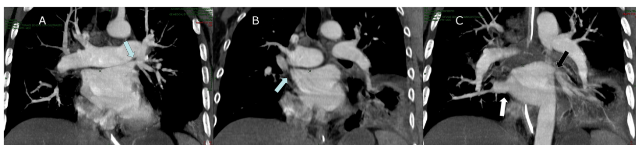
Fig. 2 a Computed tomography angiography A-P projection showed the concentric severe stenosis of the left superior pulmonary vein (arrow). b CT angiography A-P projection showed 50 % stenosis of both right superior pulmonary (arrow). c CT angiography A-P projection showed ectatic right inferior vein (white arrow) and stenosis of left inferior pulmonary vein (black arrow)

Haemoptysis, the main symptom described in our case report, is relatively infrequent [3, 7]. Its etiopathogenesis has not yet been clarified, but the increase in venous