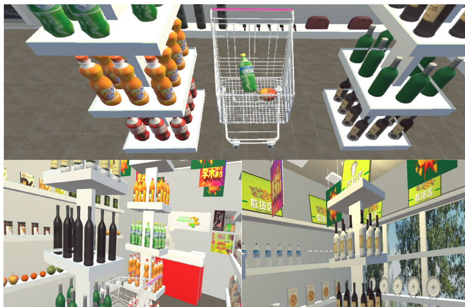
Fig. 1 Screenshots showing different views within the virtual reality supermarket developed by our team. The shopping cart (upper) and the goods (lower) are shown

A trained psychiatrist assessed cognitive function using the MCCB. The MCCB includes 10 neurophysiologic tests that are clustered in 7 cognitive domains: speed of