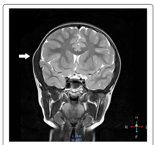
Fig. 2 Isolated right temporalis muscle hypertrophy on a coronal MRI image. T2W image of the cMRI study demonstrating enlarged right temporalis muscle on a coronal section without abnormal contrast enhancement. White arrow head indicate enlarged right temporalis muscle

of masticatory muscles. Majority are bilateral with rare cases presenting as unilateral [1–3]. Isolated unilateral temporalis muscle hypertrophy is an extremely rare condition. The first case was reported by Wilson and Brown in 1990 [9]. For the last two decades, there have been only nine cases reported in English literature (Table 1).