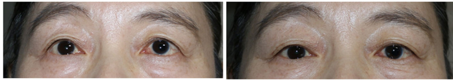
Fig. 2 Left) Postoperative photograph demonstrating slight hypertropia of the left eye as the right eye fixates on a distant target. Right) Postoperative photograph demonstrating orthophoric alignment as the left eye fixates on a near target

This report describes a case of HBP with hypotropic DVD in an eye with monocular vision loss. Prior to strabismus surgery, the patient demonstrated distance/near fixation disparity, that is, orthophoric at near fixation and intermittently hypotropic at distance fixation, a typical presentation of hypotropic DVD [4–6]. The patient used the normal vision right eye exclusively for distance fixation, leading to intermittent downward drifts of the poor vision left eye. At near fixation, the patient attempted to recruit the left eye to achieve peripheral fusion and was orthophoric at near fixation. Preoperative, intermittent downward drifts of the left eye remained below the horizontal meridian, another typical manifestation of hypotropic DVD [4–6]. Hypotropic DVD has some striking similarities with hypertropic DVD including slow, vertical drift which returns back to the midline position, the dissociated nature of the deviation, intermittent deviation depending on the fusional status, and potential association with horizontal strabismus [4]. However, there are a few notable differences between hypotropic and hypertropic DVD. First, hypotropic DVD demonstrates downward drifts of the deviating eye without any torsional eye movements; second, hypotropic DVD is not related to latent nystagmus; third, hypotropic DVD is mostly acquired and is not associated with congenital esotropia; finally, contrary to hypertropic DVD, hypotropic DVD can be overcorrected by surgery [4].