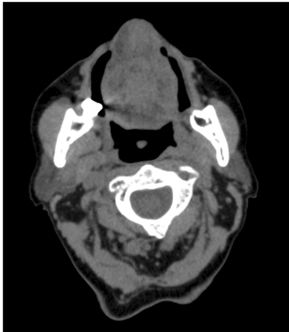
Fig. 2 CT scan after 6 months of chemotherapy showing the complete disappearance of the tumor mass primarily located in the body of the tongue

disease. From September 2013 to March 2014 the patient received 12 cycles of FOLFOX regimen. Treatment was generally well tolerated with improvement of patient quality of life, reduction of dysphagia and recovery of a normal eating. Body weight increased and local pain control was satisfactory. The CT scan performed in April 2014, at the end of the chemotherapy program (Fig. 2), showed the complete response of the primary lesion, together with the partial response of the lymphadenopathies and lung metastases. Liver metastases presented conflicting findings