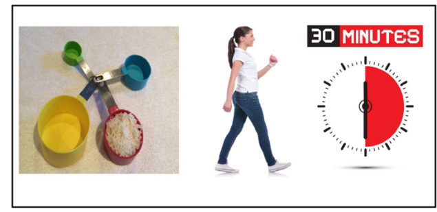
1/2 cup cooked rice = 122 calories = Walking x 30 minutes

In earlier studies, we found that most pregnant women in the area, despite their low income status, had access to smart phones and/or computer and that this was their preferred medium for learning about GDM [33]. For these reasons, we developed a web-based intervention, for use on home computers, tablets and smart phones. Women accessing the intervention progress through a series of information sheets, which address topics such as 'what is GDM' and 'what is healthy eating'. The intervention also offers practical advice and instruction such as what to do if you are hungry between meals. Instructions are phrased simply as short sentences, with a green tick, for acceptable foods, and a red x for poor choices. There are a large number of pictures and minimal amounts of text, and these are recognized as useful approaches for addressing low levels of literacy [36, 37]. An explanation of the amount of exercise that is required, and the type of exercise that is safe in pregnancy, is also included. Representation of ethnic specific food (Western, Vietnamese, Indian, Chinese) and portions appropriate for pregnant women, is placed alongside an explanation of the amount of exercise that is required to burn up the calories contained in the food, as below: