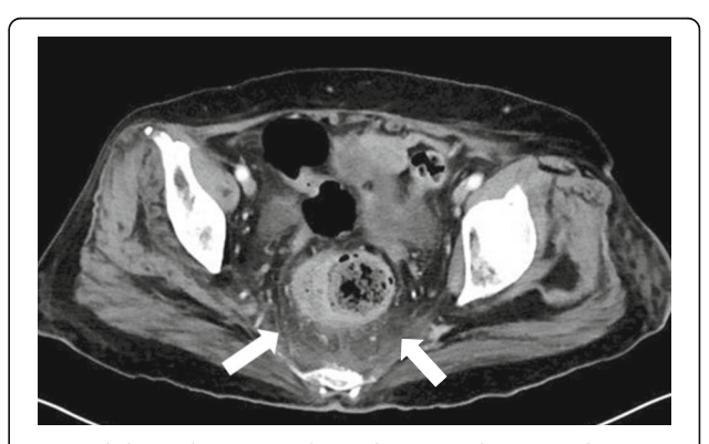
Fig. 1 Abdominal contrast-enhanced computed tomography (CT) and histopathology. Abdominal contrast-enhanced CT on day 10 of admission revealed increased inflammation surrounding the rectum, suggestive of proctitis ( arrow )

Colonoscopy was performed on day 16 of admission, which showed a giant ulcer with mucus coating at the rectum (Fig. 2a). Pathology of a rectal biopsy at 10 cm above the anal verge confirmed CMV proctitis (Fig. 3a and b). Serological tests to detect CMV immunoglobulin (Ig) G and IgM antibodies were positive and negative, respectively. HIV enzyme-linked immunosorbent assay and a CMV pp65 antigen test were both negative.