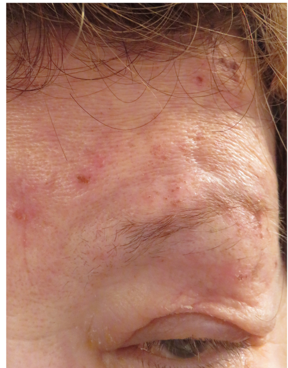
Fig. 2 Left herpes zoster ophthalmicus. The second patient with a skin eruption in the left V1 trigeminal dermatome

The third patient, a 72-year-old woman planned for cataract surgery, presented 13 days after the first dose of a Moderna mRNA vaccine with an eruption in the left