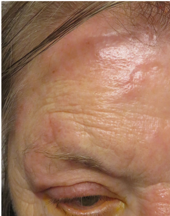
Fig. 1 Right herpes zoster ophthalmicus. Presence of a typical HZO eruption in the right V1 trigeminal dermatome in patient 1

The first patient was a 73-year-old woman with a history of ocular sarcoidosis. She presented HZO in the right V1 dermatome (Fig. 1) 16 days after a single booster dose of vaccination (Pfizer BioNTech), 8 months after having suffered from covid-19 infection. She was referred by her dermatologist 4 days after he started a valacyclovir treatment (1000 mg 3x/ day). BCVA was 0.3 OD and 1.0 OS. At the slit lamp examination, the cornea was clear, without signs of dendrite formation and anterior chamber was normal. Laser flare photometry (LFP) showed subclinical inflammation due to ocular sarcoidosis with values of 62.9 ph/ms OD et 40.9 ph/ms OS (normal 4–6 ph/ms). Intraocular pressure (IOP) was 10 mmHg OD and 12 mmHg OG. Vitreous showed trace cells in both eyes and several quiet scars in both fundi. The patient presented extreme pain in the region of the V1 dermatome which was not controlled with 1st step analgesic drugs. We therefore prescribed capsaicin ointment (0.025%) which was very effective in relieving her pain. Evolution was rapidly favourable.