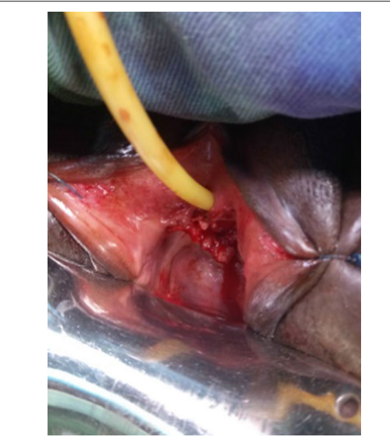
Fig. 4 Foleys urethral catheter inserted with no urine leakage after the slings were adjusted from the abdomen before the two ends were tied

operation done with no clinical evidence of stress incontinence at 6 months after the procedure. A study in Tanzania showed that history of vaginal scarring, involvement of the urethra, and number of previous VVF repair were associated with poor outcome [4].