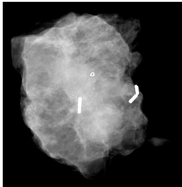
Specimen radiograph after wide local excision for localised ductal carcinoma in situ , demonstrating microcalcification in the centre of the specimen with marker clips for orientation. The additional titanium clip visible is that inserted after mammotome core biopsy.

of what constitutes an 'adequate' margin of excision, it is important that individual institutions adopt appropriate local protocols and evaluate their longer-term results, amending these protocols as further evidence on adequacy of surgical excision margins emerges in the literature.