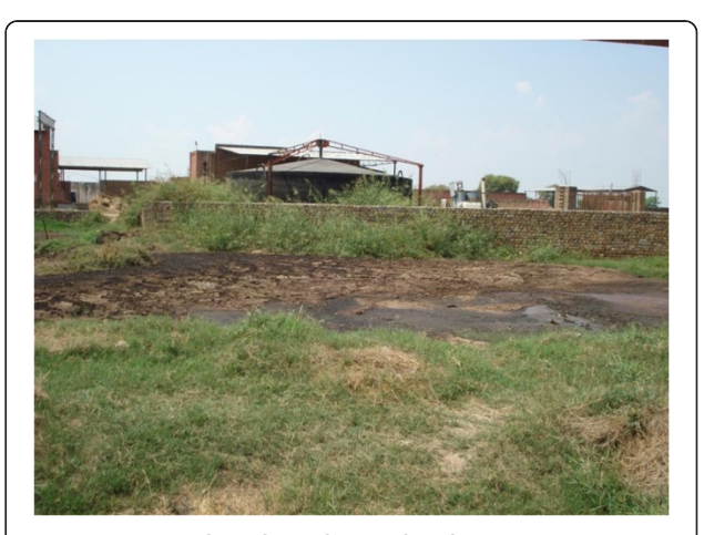
Figure 3 Biogas plant slurry disposed in the open.