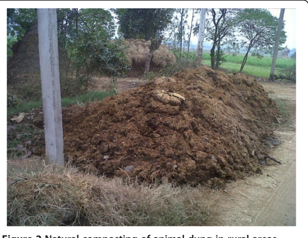
Figure 2 Natural composting of animal dung in rural areas.

In the last few decades, the Government of India has promoted biogas production at individual and community levels using cattle dung and various other wastes. Biogas is used as cooking and heating fuel in rural areas in India. During this process, animal dung is converted into slurry which is good-quality manure and can be applied in agricultural fields as soil conditioner (Figure 3). However, it was observed that farmers are reluctant to apply it directly to agricultural fields. So some new