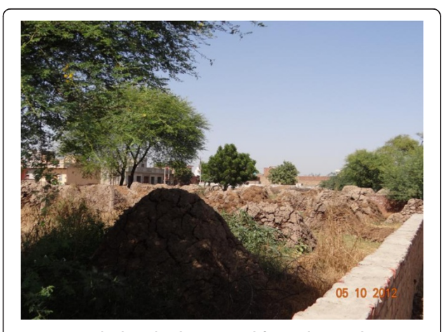
Figure 1 Cattle dung bricks prepared for cooking and heating fuel.

Fresh cow dung (CD) was procured from an intensively live-stocked farm at Hisar, India. Anaerobically digested biogas plant slurry (BPS) was procured from a postmethanation storage tank of an on-farm biogas plant.