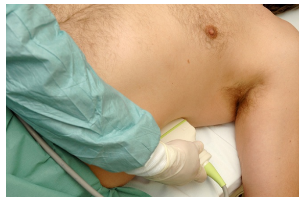
Figure 1 Placement of US probe for V-line visualization (left lung base).

This V-line sign can help to differentiate between fluid and air as the cause of the dark echo-poor area seen above the diaphragm with normal lung and with pleural