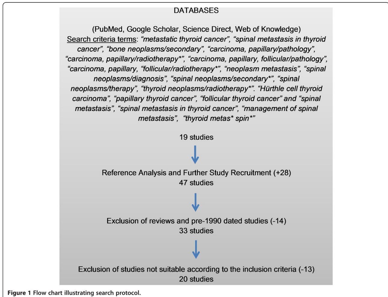
Figure 1 Flow chart illustrating search protocol.

A thorough electronic literature search was conducted using online journal databases. These included PubMed, Google Scholar, Web of Knowledge, Science Direct and