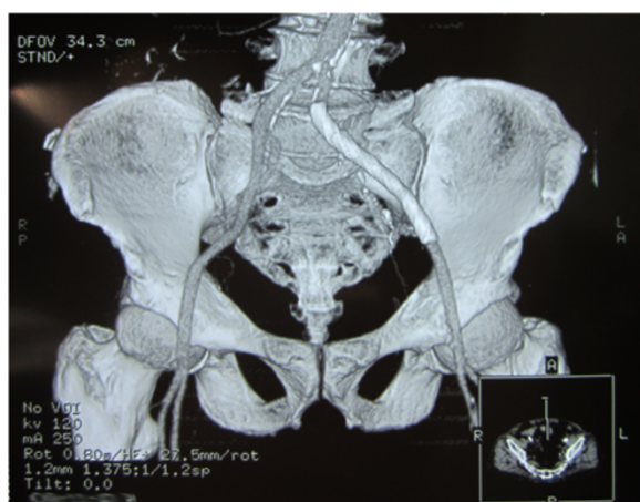
Figure 3 Imaging of computed tomographic angiography after 30 days of discharge. Contrast-enhanced computed tomographic angiography after 30 days of the treatment revealed a well-expanded stent and total occlusion of pseudoaneurysm.

transplantation [4], interventional procedures [5] or neoplasia [6] that cause laceration of part of the vessel wall and extravasation of blood into surrounding tissues, followed by tamponade and clot formation. Typically, PAs present with pulsatile masses, compressive symptoms, secondary hemorrhage and neurologic deficit as the most common clinical manifestations. However, even spontaneous PAs or PAs without clear origins are clinically rare; they have been reported to occur in the facial artery [7], tibioperoneal trunk and anterior tibial artery [6], lumbar artery [8] and superficial femoral artery [9], presenting as pulsatile masses in the former two cases and as ruptured hemorrhage in the latter two respectively.