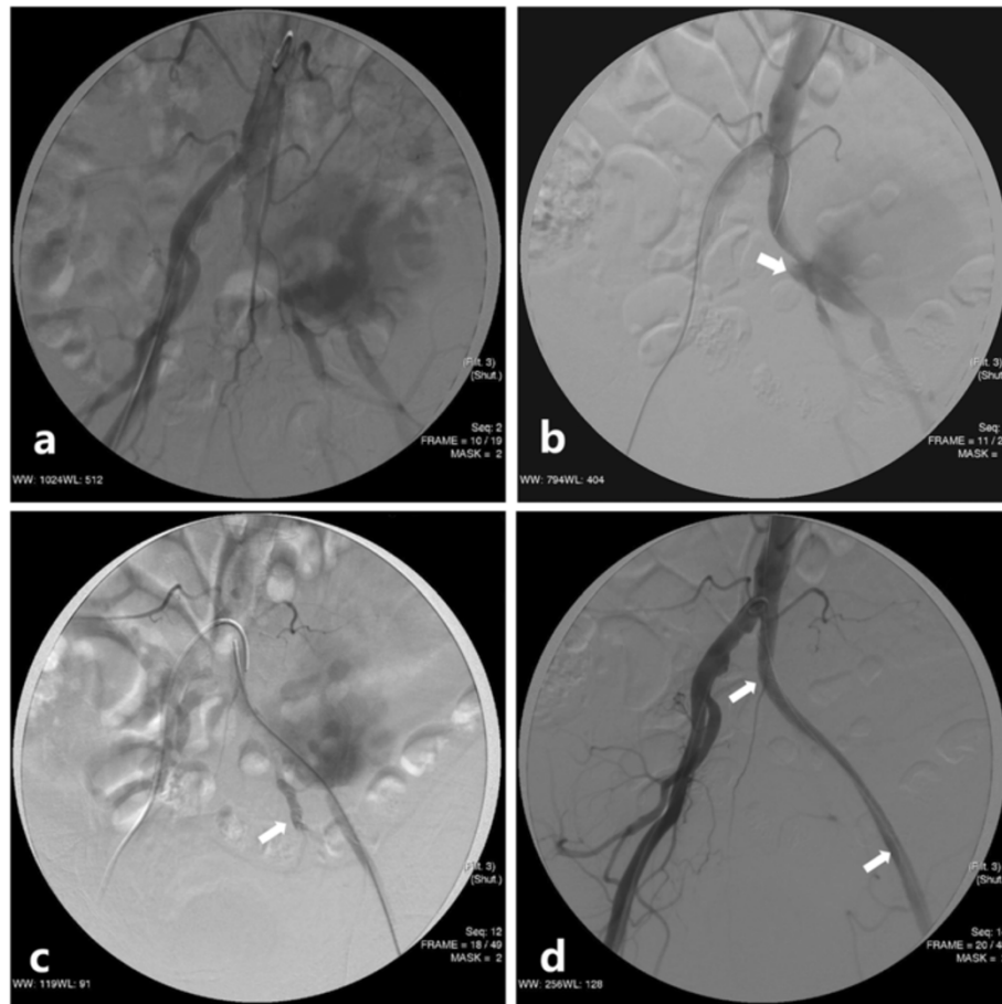
Figure 2 Imaging of angiographies during the endovascular procedure. (a) Preprocedural selective left iliac angiogram confirmed the existence of a huge pseudoaneurysm from the left iliac artery and (b) clearly revealed the orifice (arrow) of the pseudoaneurysm with a wide neck located at the bifurcation of the left common iliac artery. (c) Metal coils (arrow) were fixed at the distal end of the left internal iliac artery. (d) Postprocedural selective angiography demonstrated complete exclusion of pseudoaneurysm with a self-expandable covered stent (arrows marked the proximal and the distal ends respectively).