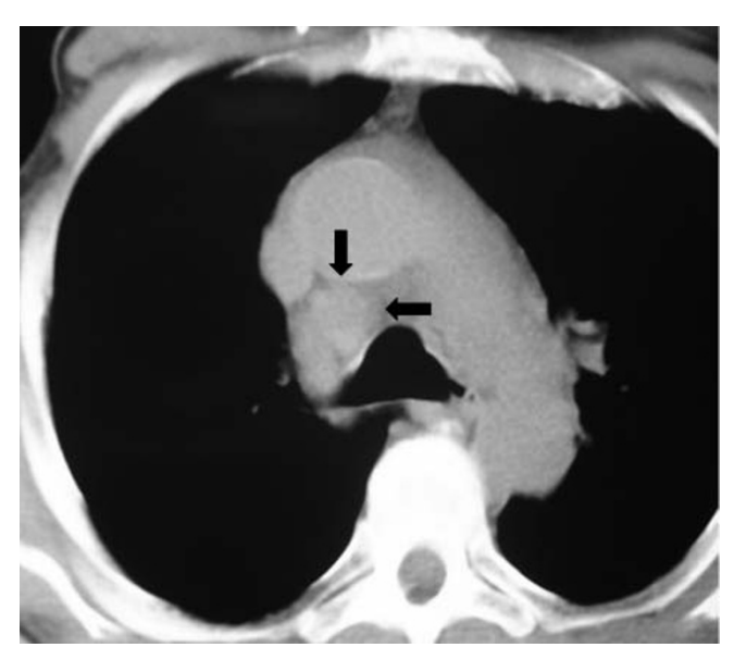
Figure 2 A computed tomography scan of the chest showing enlarged paratracheal lymph nodes over the superior anterior mediastinum.