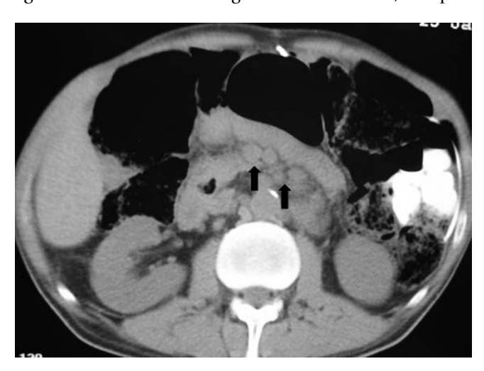
Figure 3 An abdominal computed tomography scan showing para-aortic lymphadenopathy.

TB is the foremost cause of death from a single infectious agent in humans. According to recent estimates, one per-