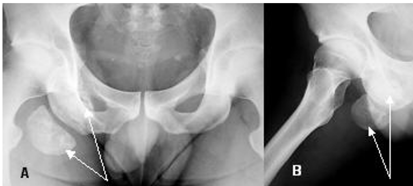
Figure 1 Pre-operative radiographs of the pelvis. (A) Anteroposterior; (B) lateral. The arrows point to the heterotopic bony masses.

Sciatica affects adults (up to 40%) and may be caused by various intraspinal or extraspinal pathologies. The most common intraspinal cause is inter-vertebral disc prolapse, which can be asymptomatic in 20% of patients. In young patients, the possibility of destructive lesions of osseous or neural tissues of the lumbar spine, such as infection (poliomyelitis, osteomyelitis, spine abscess) or tumours (meningioma, neurofibroma, metastatic lesions), must