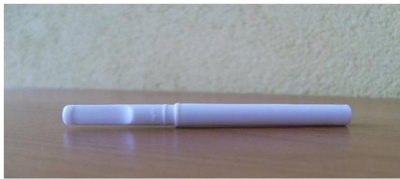
Figure 2 The PAIPO nicotine-free inhalator (Echosrl, Milan, Italy).

It is a plastic device that resembles a cigarette and is intended to replace some of the rituals associated with smoking gestures. The plastic device contains a sponge filter soaked in natural oil enriched with extracts of different aromas.