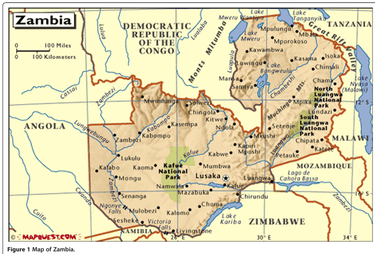
Figure 1 Map of Zambia.

Data collection was conducted from January 2012 to August 2012. Key informant interviews were conducted with members of the CHA strategic team and with senior health officials in Kapiri Mposhi district. Using the list of CHA strategic members, interview appointments were made to strategic team members through visits to the offices while appointments for other staff from the MoH were made through phone calls. Although attempts were made to schedule interviews with all strategic team