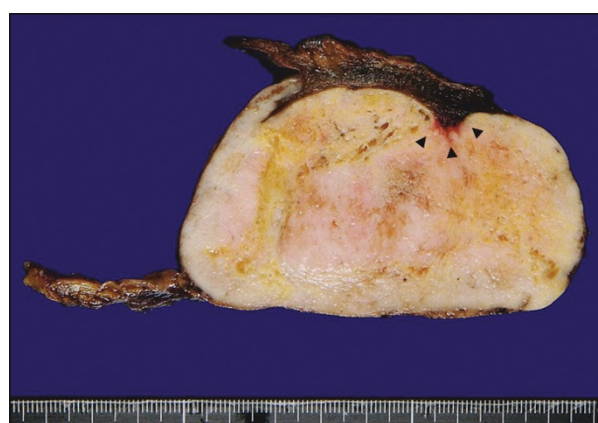
Figure 2 The oval-shaped tumor had a smooth surface, and its cut surface was homogenously solid with a yellowish-white color. The tumor was partially involved in the lung parenchyma (arrowhead).

uneventful recovery and was discharged on postoperative day 6. An ectopic pulmonary site of origin, such as the mediastinum in this case, should be accepted only after the possibility of spread or metastasis from primary intracranial or intraspinal origin has been excluded. One month after operation, the patient had an enhanced magnetic resonance imaging (MRI) of the head and spine, and no abnormal findings were observed, which eliminated the possibility of an intracranial or intraspinal origin. He has been monitored for 12 months as an outpatient without any symptoms of recurrence or metastasis.