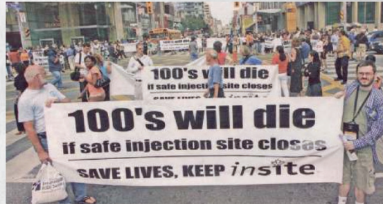
Hundreds of demonstrators took to the streets to send Harper a message: "100s will die if the safe injection site closes."

The facility is supported by the Vancouver Police Department, the City of Vancouver and Premier of BC, Gordon Campbell. It was granted a three-year operating exemption under Section 56 of the Controlled Drugs and Substances Act. Prime Minister Harper may