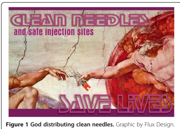
Figure 1 God distributing clean needles. Graphic by Flux Design.

The presiding judge at the BC Supreme Court, Justice Ian Pitfield, highlighted this absolutely critical cultural admission in his Reasons for Judgment when he stated: