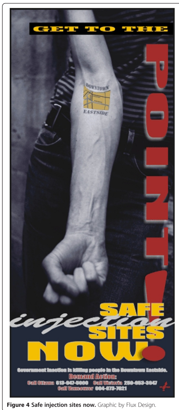
Figure 4 Safe injection sites now. Graphic by Flux Design.

“Additionally, the morality of the activity the law regulates is irrelevant at the initial stage of determining whether the law engages a s. 7 right. Finally, the issue of illegal drug use and addiction is a complex one which attracts a variety of social,