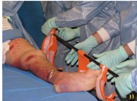
Figure 2 Students performing CT-6 traction splint. Consent for the photographs was obtained from students and representative of the donor.

The workshop enabled students to appreciate the differences in normal tissue variation: 'it was awesome to put it into perspective and really hone in on the importance of how different and dynamic our bodies are compared to mannequin' .