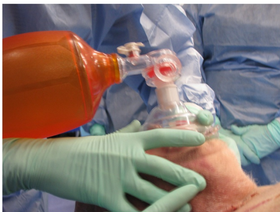
Figure 1 Students performing Bag-Value-Mask seal on a donor. Consent for the photographs was obtained from students and representative of the donor.

Students reported a statistical significant improvement in perceived self-confidence after the workshop (see Table 2). Cronbach's \alpha coefficients for the eleven items were 0.89 (pre-) and 0.91 (post-workshop), indicating very good internal consistency across the items as a single construct [22].