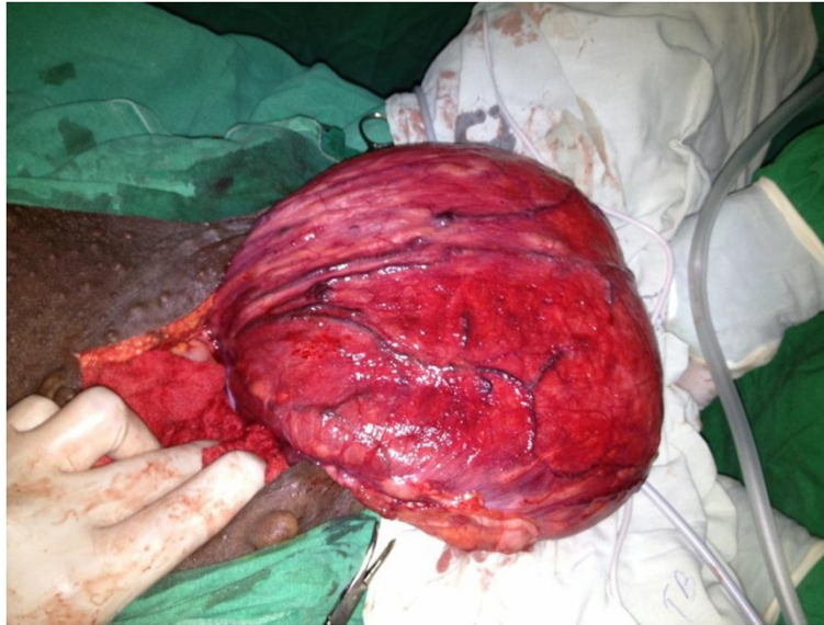
Figure 4 Large neuropathic bladder found during surgery.

fossa. Her US scan of the abdomen revealed mild right sided hydronephrosis. She underwent sigmoidoscopy which was normal up to the proximal sigmoid colon. Barium enema (Figure 3) showed herniation of the rectum through a defect in the pelvic floor.