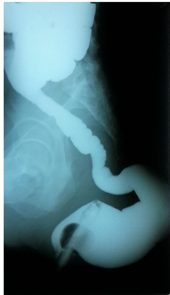
Figure 3 Barium enema showing the herniated rectum.