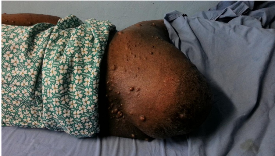
Figure 1 Large R/sided buttock hernia.

undergone excision of neurofibromas adjacent to right knee joint and over the right buttock 7 years back. She did not have a family history of neurofibromatosis. She did not give a past history of hypertension or other comorbidities. On examination, she had multiple neurofibromas all over the body and one plexiform neurofibroma over left knee area. There was a non reducible lump of 25× 20 cm size over the right buttock. It had an expansile cough impulse and was non tender on palpation. Digital rectal examination was normal. Therefore, a clinical diagnosis of a secondary perineal hernia was made.