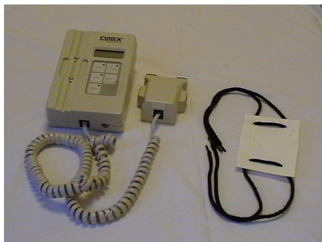
Figure 1 Inclinometer and plastic plate.

When the measurement protocol was worked out, we selected a strategy in which previously reported ways of measuring were employed to a maximum degree. Unfortunately, studies often do not give specific details on how measurements were made [1]. Furthermore, some methods reported in other studies were not suited for our study population. The measurement protocol is a mixture of previous recommendations, and to some extent, our own clinical experience. The protocol involved measuring the range of passive and active motion of four different movements of the shoulder.