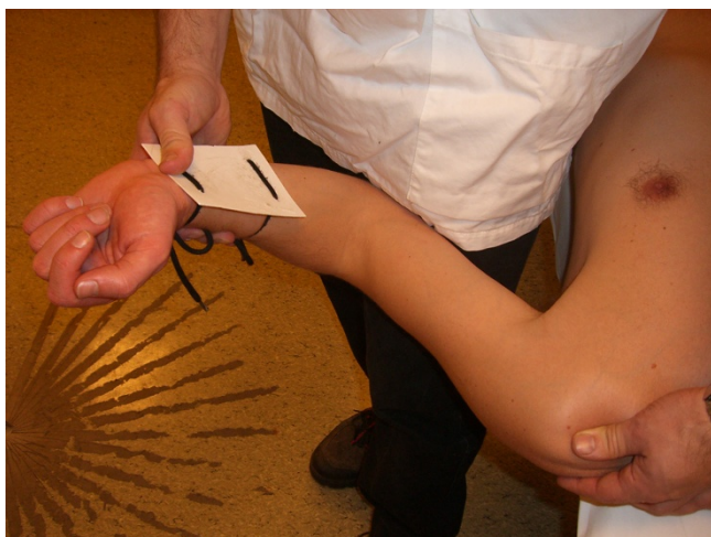
Figure 4 Passive external rotation movement.

Passive internal rotation (P. INT): The starting position is the same as for P. EXT, except that the plastic plate is attached to the lateral side of the lower arm. The arm is