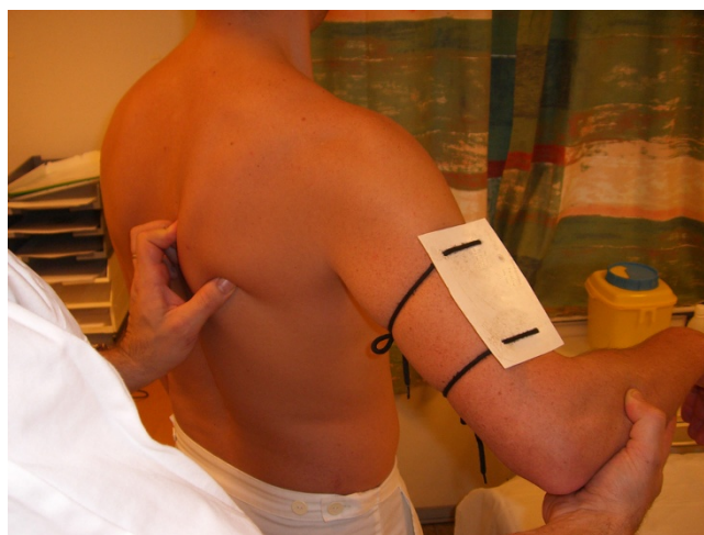
Figure 2 Passive abduction movement.

Passive external rotation (P. EXT): The patient is lying down. The plate is placed along the distal, medial part of the ulnar and radial shafts. The patient's upper arm is held at about 45 degrees of abduction (allowing for necessary movement of the scapula in order to reach this position).