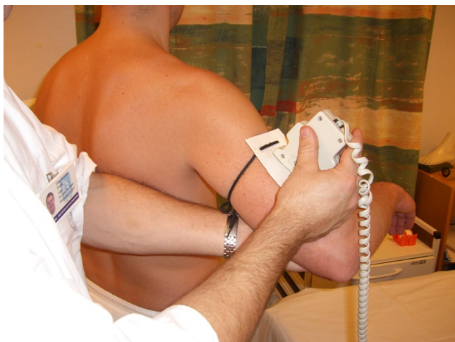
Figure 3 Passive abduction; arm stabilization and measurement of end-of-range point.

The elbow is held at 90° with the lower arm vertical in the starting position. The physician stabilizes the acromion during the movement while the patient's arm is slowly rotated to the end-point (Figure 4). The plate is held perpendicular to the movement. The end-point is determined at the point where resistance to the movement is felt and before the acromion begins to move. The arm is stabilized and the inclinometer is read (Figure 5).