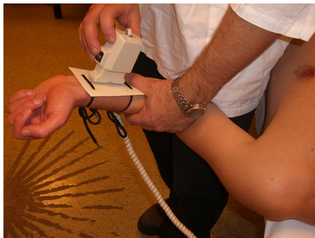
Figure 5 Passive external rotation; arm stabilization and measurement of end-of-range point.

rotated internally. The rotation is stopped when resistance is met, and before the acromion begins to move. The arm is stabilized and the inclinometer read.