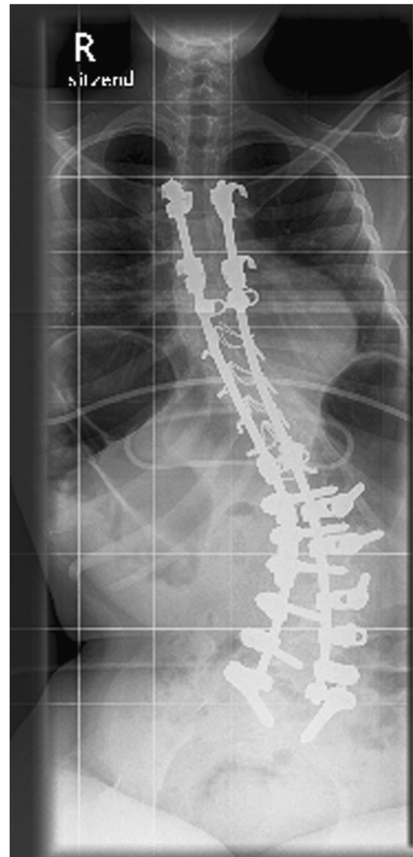
Figure 2 Anteroposterior X-ray of the spine at follow-up: Cobb angle of 46° (Th7-L2-L5) left-convex, 30° pelvic tilt to the left.

Patient 6 received achillotenotomy and a transfer of the tendon of the tibialis posterior muscle to os cuneiforme laterale on the right side at the age of 12. Five days after the operation, he suffered from wound dehiscence in the area of the achillotenotomy, triggered by forced mobilisation (by the non compliant patient). We irrigated the area and closed the wound by secondary suture. Twelve days after that, a second complication of the initial operation occurred. This time, the wound dehiscence was on the right medial midfoot, the area of the tendon transfer. We applied an hydrocolloid wound dressing. A week later, we removed the dressing and found a pronounced skin maceration with local flush.