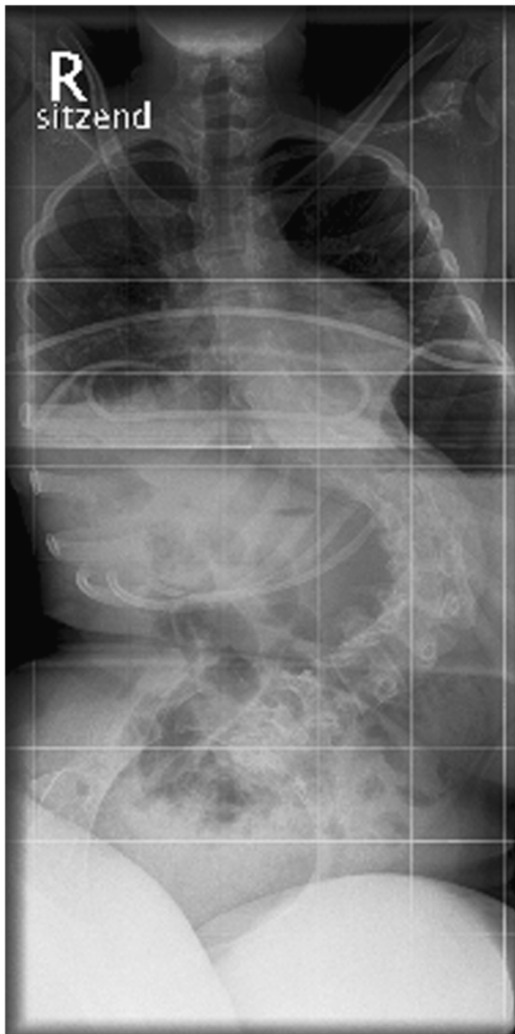
Figure 1 Anteroposterior preoperative X-ray of the spine: Cobb angle of 100° (Th8-L1-L5) left-convex, 45° pelvic tilt to the left.

Patient 6 received achillotenotomy and a transfer of the tendon of the tibialis posterior muscle to os cuneiforme laterale on the right side at the age of 12. Five days after the operation, he suffered from wound dehiscence in the area of the achillotenotomy, triggered by forced mobilisation (by the non compliant patient). We irrigated the area and closed the wound by secondary suture. Twelve days after that, a second complication of the initial operation occurred. This time, the wound dehiscence was on the right medial midfoot, the area of the tendon transfer. We applied an hydrocolloid wound dressing. A week later, we removed the dressing and found a pronounced skin maceration with local flush.