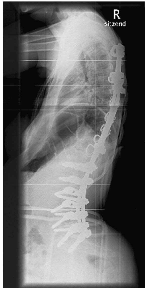
Figure 4 Lateral X-ray of the spine at follow-up: Cobb angle of 46° (Th7-L2-L5) left-convex , 30° pelvic tilt to the left.

that this patient's reaction to the material caused the wound healing disturbance.