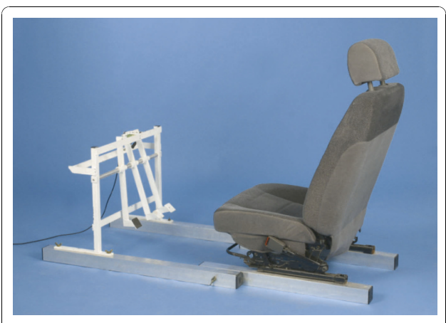
Figure 2 Custom-made apparatus to measure brake response time.