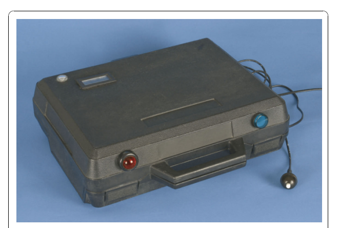
Figure 3 The external suitcase containing the logic gate electronics, the trigger, the green and red lamp, and the clock.

When the accelerator was completely depressed the green lamp shone, indicating that the patient did not 'drive' in a 'ready-to-brake fashion'. After 5 to 10