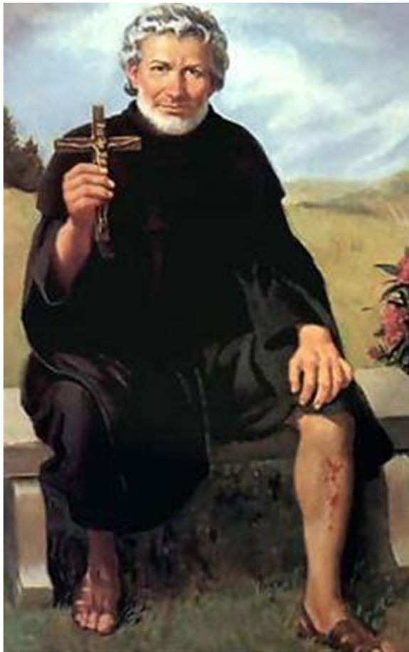
Figure 1 St. Peregrine (1260–1345).

their successful use in the therapy of cancers, especially sarcomas, between 1881 and 1936 [11-13]. Unfortunately Coley, a mild mannered and unassuming gentleman, did not adhere to rigorous scientific protocols in his studies and he was marginalized by forceful personalities advocating radiotherapy. Notwithstanding, an analysis of his results with cancer deemed inoperable undertaken in 1994 revealed a remission rate of 64% and a five-year survival rate of 44%, results equal to or better than those with modern therapies [14]. There have been several more studies on this topic [15-23], but the evidence for the effectiveness of this therapeutic approach remains disputed.